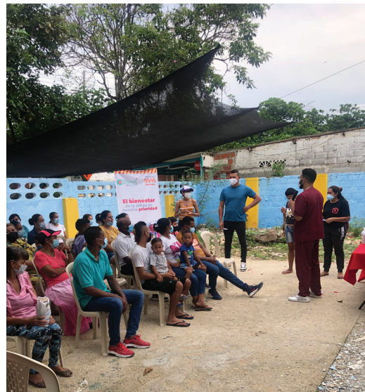
Disease prevention being taught by a medical student at our Medical Outreach with FAME in May of 2022