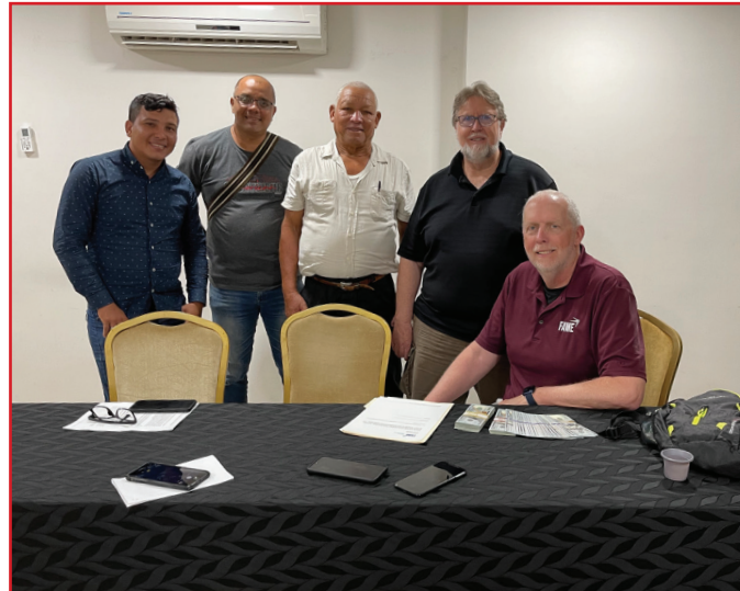
Closing on the Casa Firme property.

We want to say thank you to the FAME Board of Directors who approved this partnership. Also a big thanks to the La Costa Colombia donors who made this possible. You will remain anonymous, but you know who you are. THANK YOU! So much good work for the Kingdom of God will be done in this location.